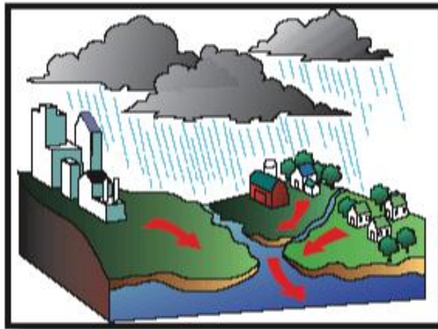
Drainage Areas and Surface Runoff

Calculation of peak storm water runoff rate from a drainage area is often done with the Rational Method equation ( Q = CiA ). Use of Excel spreadsheets for calculations with this equation and for determination of the design rainfall intensity and the time of concentration of the drainage area, are included in this course. The parameters in the equations are defined with typical units for both U.S. and S.I. units.