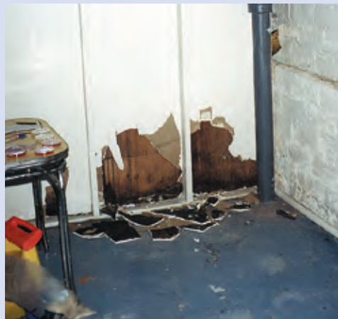
Photo 3B: Front side of wallboard looks fine, but the back side is covered with mold