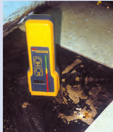
Photo 9: Moisture meter measuring moisture content of plywood subfloor