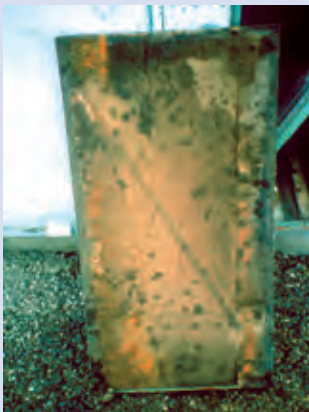
Photo 4A: Contaminated fibrous insulation inside air handler cover

Do not run the HVAC system if you know or suspect that it is contaminated with mold. If you suspect that it may be contaminated (it is part of an identified moisture problem, for instance, or there is mold growth near the intake to the system), consult EPA's guide Should You Have the Air Ducts in Your Home Cleaned? 4 before taking further action (see Resources List).