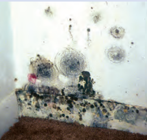
Photo 3A: Mold growing in closet as a result of condensation from room air