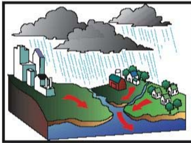
Drainage Areas and Surface Runoff

Calculation of peak storm water runoff rate from a drainage area is often done with the Rational Method equation ( Q = CiA ). Calculations with the Rational Method equation often involve determination of the design rainfall intensity and the time of concentration of the watershed as well. An Excel spreadsheet for making these types of calculations is included with this course. Example calculations and examples using the course spreadsheet for Rational Method equation calculations and for determination of the design rainfall intensity and the time of concentration of the drainage area, are presented and discussed in this course. The parameters in the equations are defined with typical units for both U.S. and S.I. units.