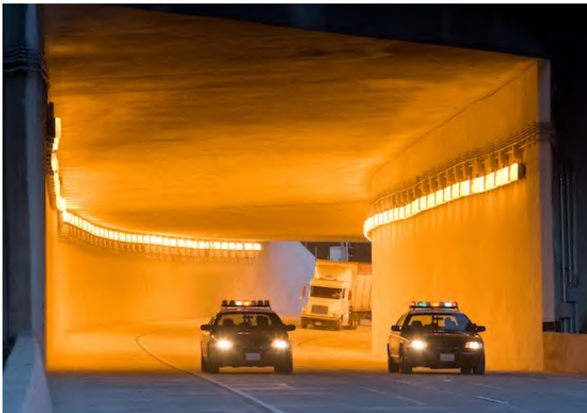
Figure 2.8 – Police escort through tunnel to mitigate safety concerns.

Quantitative methods can be used to evaluate security risk to tunnels that include threats, vulnerabilities, and consequences. One method developed for the Transportation Security Administration by the US Army Corps of Engineers ( See Appendix A ) evaluates risk in two distinct areas: Operational Risk and Casualty Risk. This is a component-level methodology that evaluates mitigated and unmitigated threats. The tunnel owner can evaluate the effectiveness of strategies to minimize damage, limit loss of life and function, and allocate resources. The Operational risk analysis allows an owner to select an “Operational Loss of Service” damage level and then evaluate the current and mitigated threat sizes relative to the specified damage level. The Casualties Risk Analysis uses a scenario-based procedure to select a threat size and location. From this information, the current and mitigated casualties are evaluated. This risk process is used for new and existing designs to develop mitigation strategies and to effectively reduce costs. By using the quantitative risk assessment, the multi-hazard concept of operations can be developed.