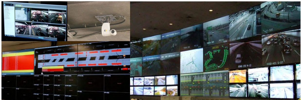
Figure 2.4 – Incident detection systems facilitate a rapid response to the emergency.