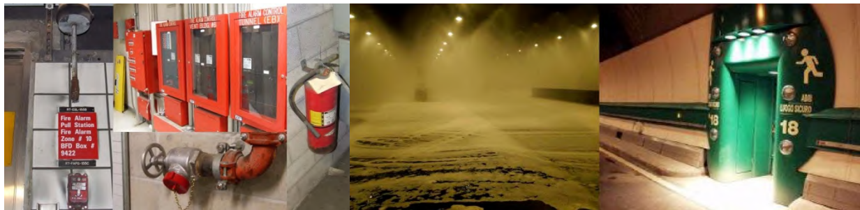
Figure 2.5 – Fire protection equipment and accessible escape routes.

Fire support personnel and other first responders should be notified immediately; however, emergency responders may not always arrive at the scene in time to assist with the evacuation. In the period before the emergency responders arrive on the scene, self-rescue should be encouraged. The vehicles in front of the accident site should be directed to exit out of the tunnel in the direction of travel. The tunnel occupants trapped behind the fire and debris generally must evacuate on foot.